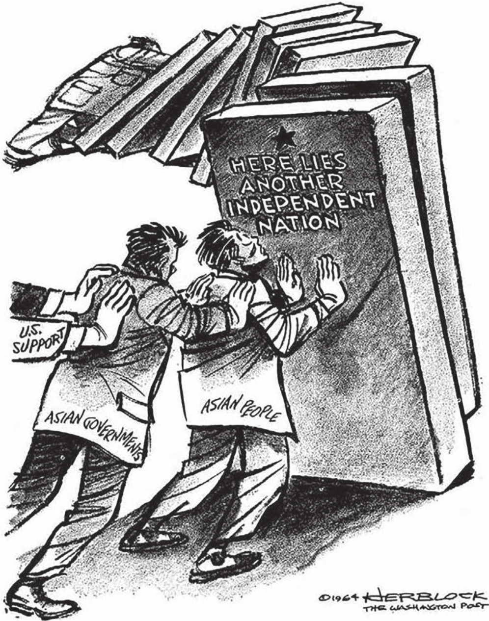
A cartoon published in the United States in May 1964.